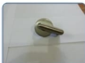
THUMB TURN SS 304 Grade