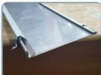
SHOE COVER SS 304 1830 MM