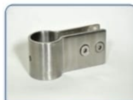
PANEL HOLDER SS 304 Grade