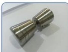
DOOR KHOB SS 304 Grade