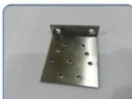
FLOOR ANCHOR SS 304 Grade