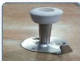
COAT HOOK SS 304 Grade