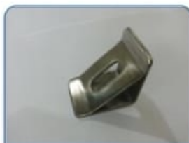
L BRACKET SS 304 Grade