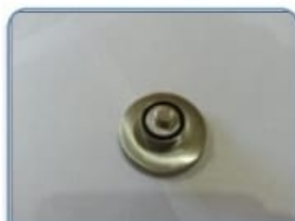
WALL FIXING SS 304 Grade