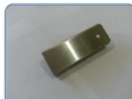
SIDE COVER SS 304 G(12MM)