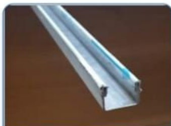
U CHANNEL SS 304G 1830 MM

Manufacture of: TOILET CUBICLE PARTITION & ACCESSORIES