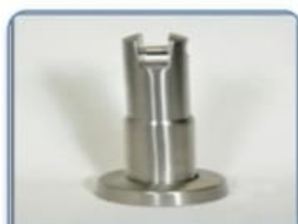
ADJUSTABLE LEG SS 304 Grade

Manufacture of: TOILET CUBICLE PARTITION & ACCESSORIES