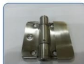
HINGE SS 304 Grade